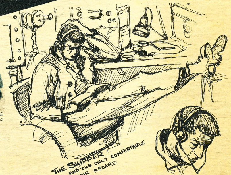
THE SKIPPER AND THE ONLY COMFORTABLE AIR ABOARD