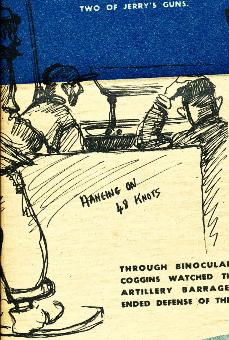
HANGING ON 48 KNOTS